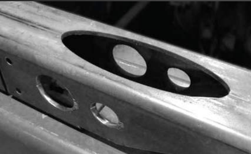
MARKING AND CUTTING ON 4 FACES